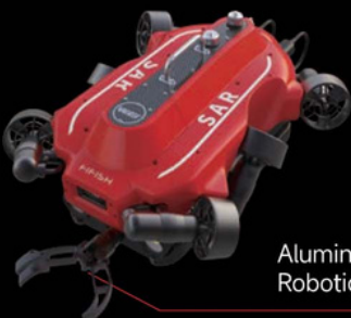
Aluminum Alloy Three-clawed Robotic Arm

FIFISH SAR VERSION ROV can be equipped with various types of grapples, adapting seamlessly to different types of environments and operational requirements.